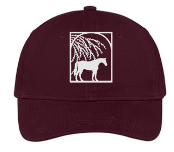
Port & Company® - Brushed Twill Low Profile Cap - Item#CP77

Switch Willow color choices: Black or White Decoration: cap logo, must add to your cart at checkout