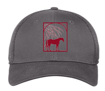
New Era® - Stretch Mesh Cap - #NE1020

Switch Willow color choices: Maroon, White or Black Decoration: cap logo, must add to your cart at checkout