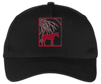
Port & Company® - Five-Panel Twill Cap - #CP86

Switch Willow color choices: Black or White Decoration: cap logo, must add to your cart at checkout