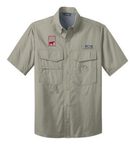
Eddie Bauer® - Short Sleeve Fishing Shirt