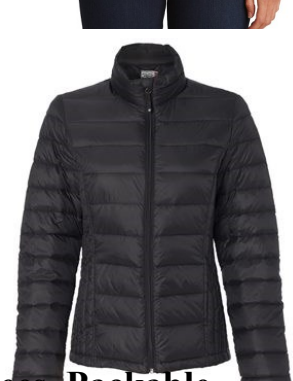
Weatherproof - 32 Degrees Packable Down Jacket - #15600W Women's / #15600 Adult /#15600Y Youth

#L325 Ladies / #J325 Adult Switch Willo color choices: Black